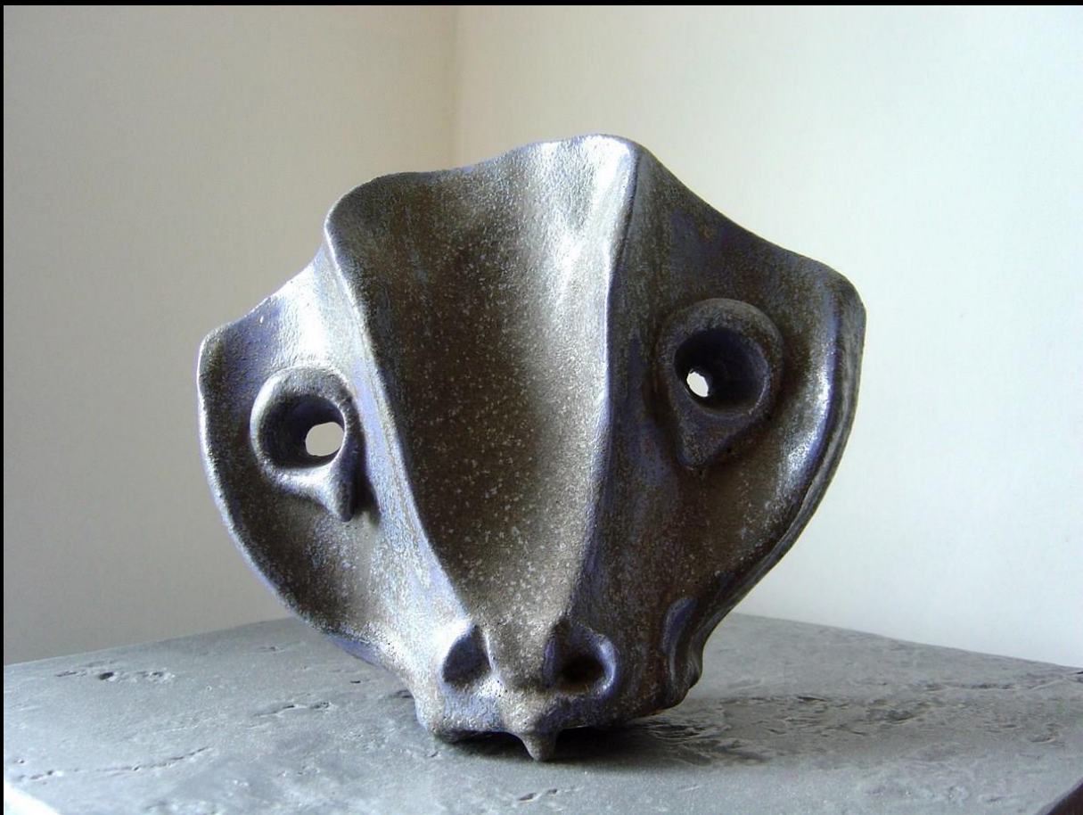
Terra Cotta Masks